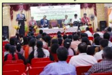
A Session in Progress in International Conference at VC&RI, Orathanadu

Veterinary Herbal Research was conducted from 19.07.2023 to 21.07.2023 at Veterinary College and Research Institute, Orathanadu benefitting 174 delegates including foreign experts.