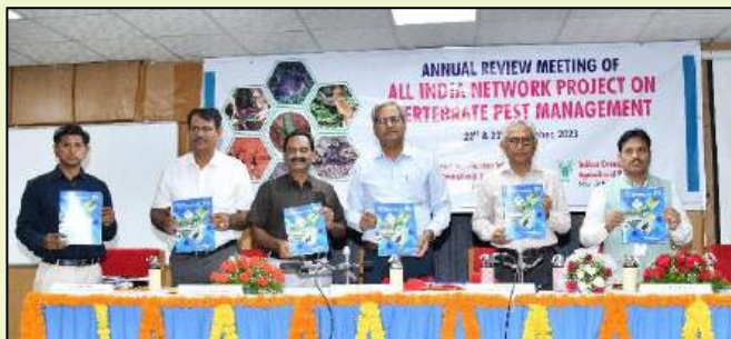
Annual Review Meeting of AINP on Vertebrate Pest Management