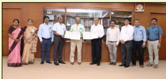
Transfer of Technology with Reliance Life Sciences Pvt. Ltd.