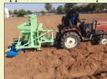
Mini Tractor-Drawn Two-Row Automatic Potato Planter Cum Fertilizer Applicator

It places potato tubers and fertilizer at recommended depth in the soil and saves about 22