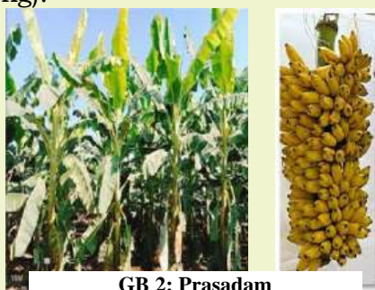
GB 2: Prasadam