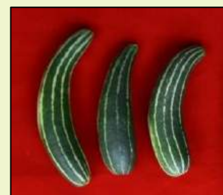
GCU 2: Anand Sheetal