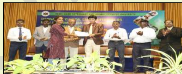
13 th Clinical Case Conference at Madras Veterinary College, Chennai