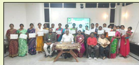
Valedictory Programme of Bamboo Value Addition and Handicrafts Preparation Training