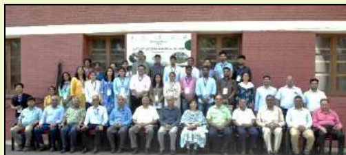
DST-SERB Sponsored High-End Workshop on Climate-Smart Livestock Farming for Sustainable Production

Sustainable Production during 18-27 September 2023.