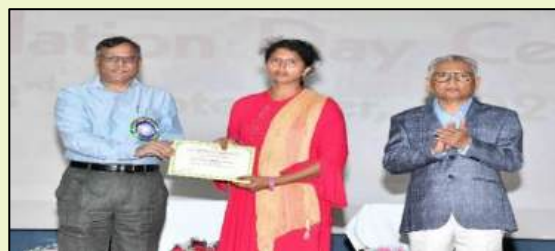
Awardee Receiving Certificate on 9 th Foundation Day of PJTSAU