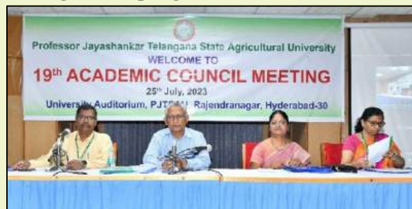
19 th Academic Council Meeting

19 th Academic Council meeting was held on 25 July 2023 at University Auditorium, Rajendranagar, Hyderabad and issues related to PG and Ph.D. programmes for the academic year 2022-23 and deputation of faculty for pursuing Ph.D. programme were discussed.