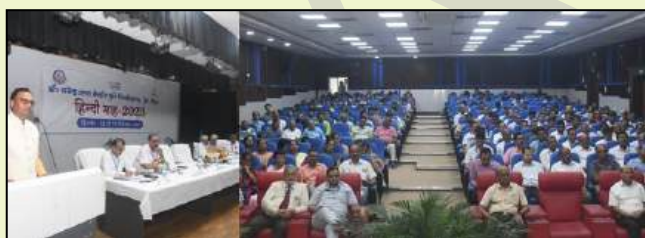
“Celebration of Hindi Chetna Maah 2023”