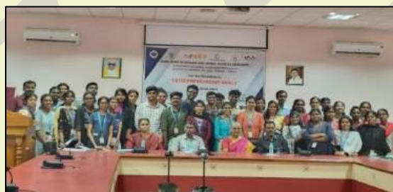
Workshop on Entrepreneurship Skills on 05.08.2023 at Madras Veterinary College for UG Students Under ICAR-NAHEP