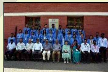
DST-SERB Sponsored High-End Workshop on “Basic Techniques for Designing, Synthesis, Characterization and Application of Synthetic Peptides in Biological Sciences”