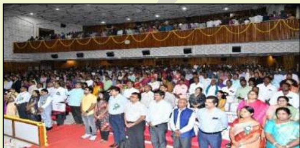
Glimpse of 9 th Foundation Day of PJTSAU