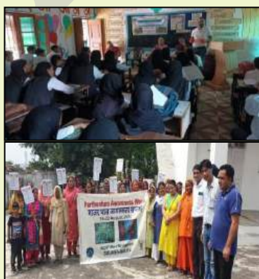
Parthenium Awareness Programme