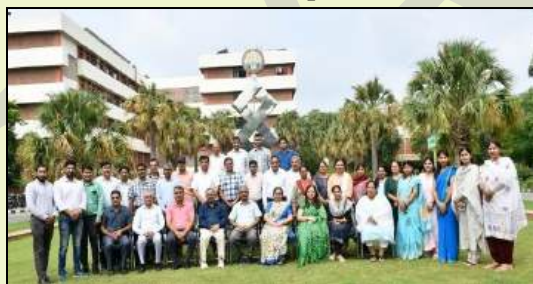
Group Photo of Participants in Refresher Course on Computer and Data Analytics