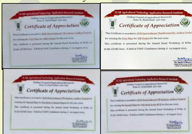
Certificates Received During Annual Zonal Workshop of KVKs Under Zone X