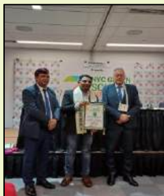
Registrar of AAU Receiving the Award at New York