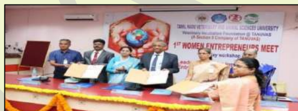
Transfer of Technology with M/s. Jeshron Biotech Solution Private Limited - 03.08.2023