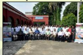
DST-SERB Sponsored High-End Workshop on “Advanced Virological Techniques for Research in Life-Science”