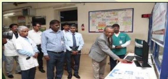
Inauguration of VeTHIMS by the Vice Chancellor, TANUVAS, Chennai