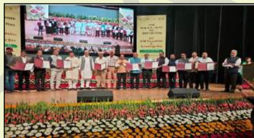
Signing of MoU at ICAR Foundation Day