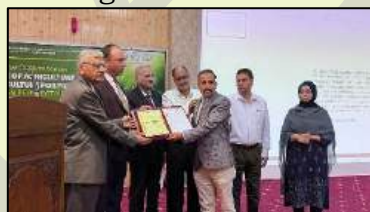
Professor Receiving the Award