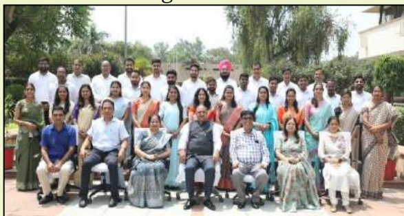
Group Photo of Participants in Induction Training

Professional Development design of course curricula including online course.