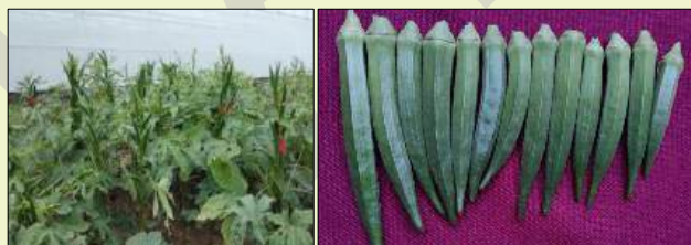
GOH 205: Anand Kranti