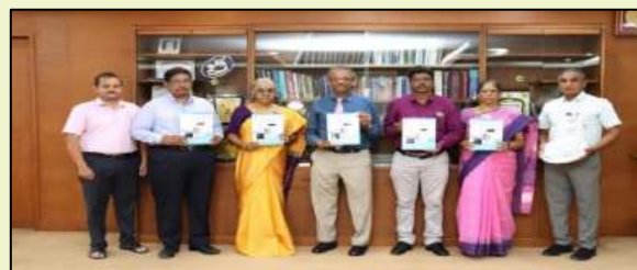
Acquiring Technology Between the Units of TANUVAS - TRPVB and Department of Animal Biotechnology, Madras Veterinary College, Chennai