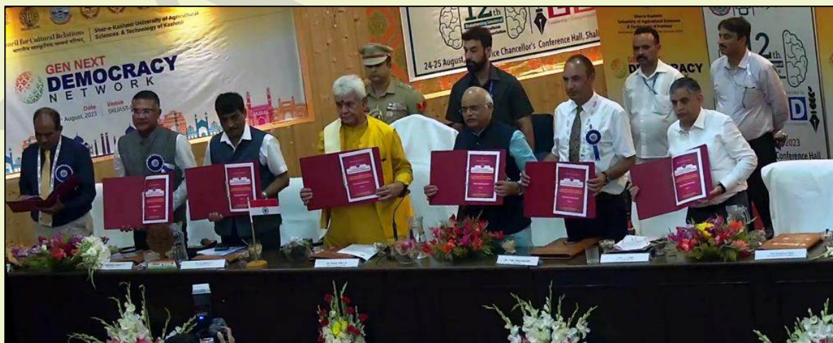
Shri Manoj Sinha, Hon'ble Lt. Governor, J&K and dignitaries releasing a publication during inaugural session of 12th Brainstorming Session of IAUA held at SKUAST-K, Srinagar

Attendees had the opportunity to learn about the future of agricultural education in alignment with the NEP-2020, bridging the skill divide in agriculture and related sectors, fostering entrepreneurship through incubation, innovation, and start-ups in agriculture universities, and maximizing the potential of Agri-4 technologies (AI, ML, IoT and Automation) for modernizing agriculture farms. This Brainstorming Session also provided an excellent opportunity for attendees to network, share ideas and best practices, and gain valuable insights into the future of agricultural education.