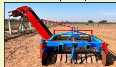
Tractor-Drawn Potato Harvester with Integrated Cart Elevator

It performs efficient digging and conveying of potato in trolley (operated by another tractor) running along with the machine. The machine has about 0.21 ha/h field capacity and saves about 86 % of the time and 30 % cost required for digging and collecting the potatoes as compared with a tractor-drawn potato digger.