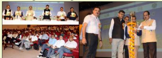
Glimpses of 30 th AGM of AICRP-RM