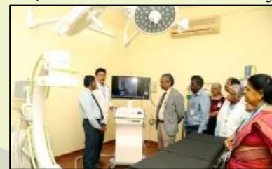
Inauguration of Interventional Medicine Referral Clinics at MVC, Chennai