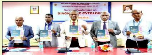
National Conference on Diagnostic Cytology - Madras Veterinary College, Chennai

09.07.2023 at Madras Veterinary College, Chennai, benefitting 100 participants at national level.