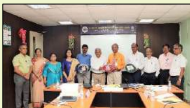
MoA with the Start-up M/s Jeshron Biotech Pvt. Ltd.,