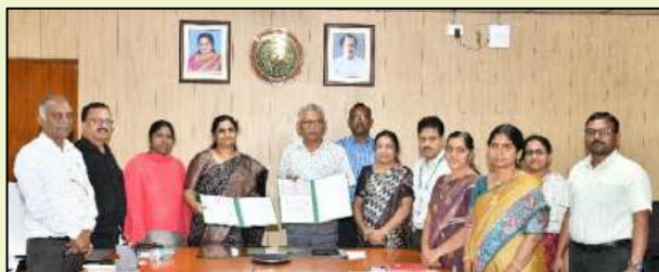
Centre for Forest and Natural Resource Management

to help in extending guidance to PG students in research on agroforestry and biodiversity conservation.