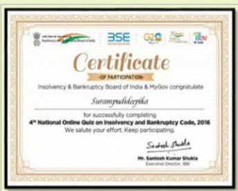
Appreciation to Dr YSRHU-KVK, National Quiz for Insolvency and Bankruptcy Code, 2016, Participation Certificates