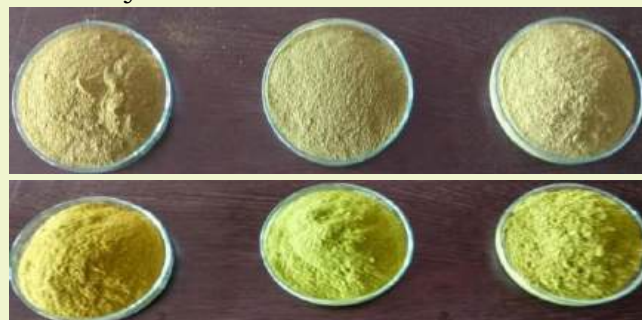
Guava and Lime Leaves Powder

The guava and lime leaves powder packed in aluminum laminated bags can be stored for up to 180 days in ambient conditions.