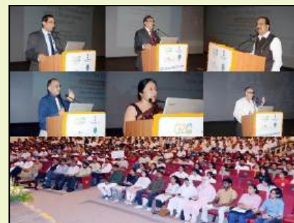
Glimpses of G20 Connect Programme

The Sher-e-Kashmir University of Agricultural Sciences and Technology of Jammu (SKUAST-J) had the privilege of being the first Agriculture University in the country to organize G20 University Connect Programme. The programme was held under the