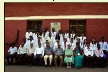
DST-SERB Sponsored High-End Workshop on “Immunological and Molecular Techniques for Detection and Quantitation of Cancer Biomarkers”