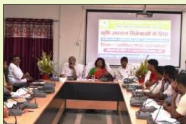
Interaction with Trainees During Training Programme

College, Agwanpur, Saharsa. Thirty participants selected from Saharsa, Supaul and Khagaria districts participated in this training programme.