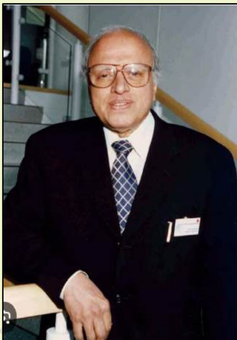
Prof. M. S. Swaminathan (7.08.1925 – 28.09.2023)

In everlasting memory of Professor Monkombu Sambasivan Swaminathan, Padma Bhushan and Padma Vibhushan awardee, Father of Green Revolution in India, First Secretary, DARE, GoI; World Food Prize winner; recipient of Magsaysay Award, Shanti Swarup Bhatnagar Award, Indira Gandhi Prize for Peace, UNEP Sasakawa Environmental Prize and UNESCO Gandhi Gold Medal; Founder Chairperson of MSSRF; one of the Founder members of IAUA; a fountainhead of knowledge and always a source of inspiration for all of us, who has left behind a rich harvest of memories to cherish, honour and emulate.