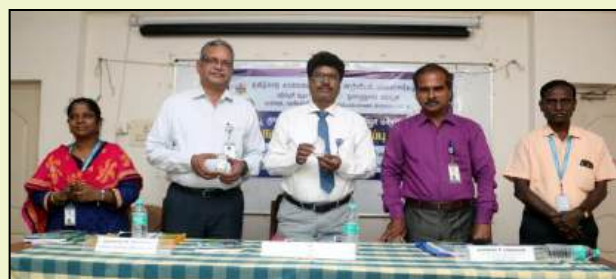
Release of Snuffles Vaccine - Rabbit Farmers Mela - 22.09.2023