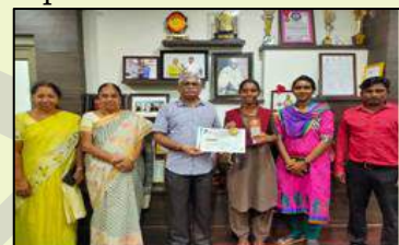
First Place in 48 th AP State Yogasana Competition