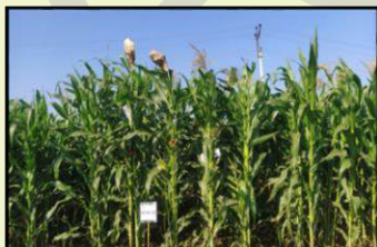
GFM 1: Anand Tall