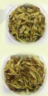
Dried Senna Leaves

The continuous microwave heating system exhibits rapid drying as compared to sun, shade, and fluidized bed drying systems.