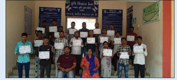
Glimpses of the programme

Vigyan Kendra, Dahod, Anand Agricultural University, from 16-22 October 2023. The trainees got hands-on practical experience in vaccination, debeaking and other routine chores involved in poultry farming at KVK's Poultry unit. A one-day exposure visit was also organized at IPDP, Department of AH, Dahod, wherein the participants were shown a live demonstration of the workings of a hatchery, followed by a visit to the IPDP poultry sheds wherein the