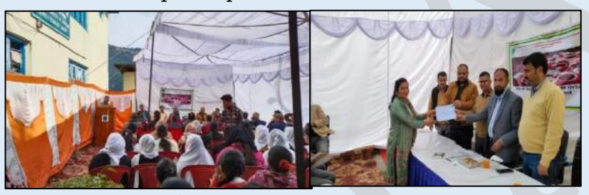
Glimpses of Kisan Mela

KVK, Doda working under the aegis of Directorate of Extension, SKUAST-J, Jammu organized programme on GI tagged Bhaderwah Rajmash and Kisan Mela at KVK, Doda on 06 November 2023 in which 203 farmers from the district participated.