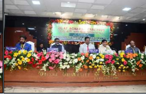
Plenary session of Agri-Edu Fair