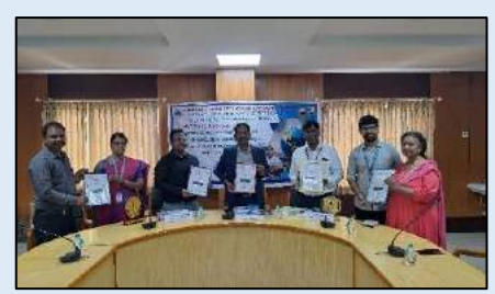
Dignitaries Releasing Publication During Workshop on Climate change

Tamil Nadu Veterinary and Animal Sciences University organized National workshop on Mitigating Climate Change Impact on Livestock Production through Strategic Transformative Approaches, at Veterinary College and Research Institute, Salem, TANUVAS on 21 November 2023.