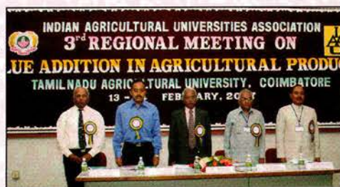
Dignitaries standing for National Anthem

The major recommendations are as under: -