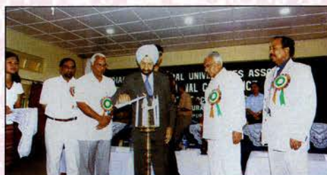
H.E. Governor of Manipur Shri S.S. Sindhu inaugurating the meeting