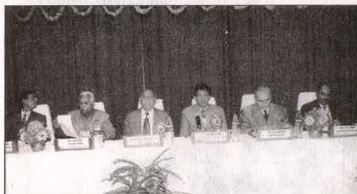
Vice-Chancellors' conference discussed new priorities in Agricultural Education. Sitting on the dais (left to right) are :