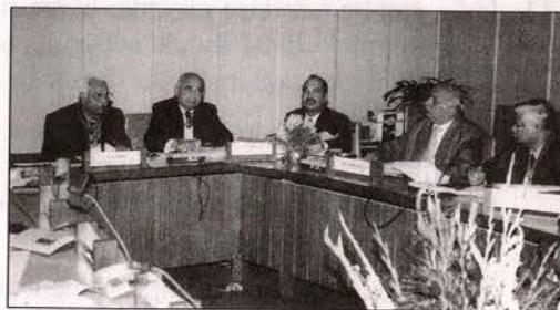
Meeting of the G.B. of IAUA in progress. The IAUA is committed in improving the quality of agricultural education through partnership between different SAUs and the ICAR