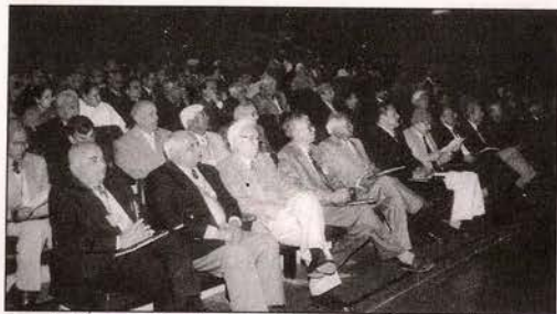
Audience at the inaugural function of the convention