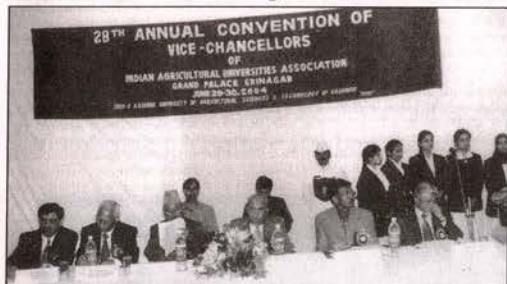
On Dias – Left to Right

The 28 th Annual Convention was held on 28-29 June 2004 at SKUAST (K), Srinagar on the theme 'Orient. agricultural education towards future needs and opportunities'. The main recommendations are given below: