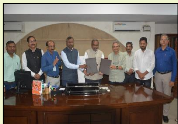
Signing of MOU between MAFSU and PAANI Foundation

husbandry, dairying and fish farming, conservation of indigenous germplasm and imparting training on various aspects for improving production and productivity of animals in the rain-fed rural areas across the state.