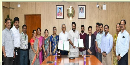
PJTSAU and M/s. Deccan Mudra Agri Pvt. Ltd. officials during MoU signing ceremony