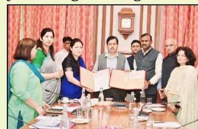
Signing of MOU between MAFSU, Nagpur and MAVIM, Mumbai

The Directorate of Extension Education, MAFSU, Nagpur signed an MOU with MAVIM, Mumbai on 1 June 2023. This MoU seeks to impart the capacity-building training of 1050 pashusakhis and 470 lead women identified by MAVIM, Mumbai through specifically designed training modules