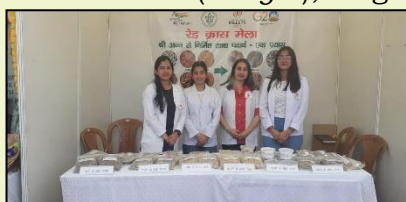
Display of Exhibits in Red Cross Mela, Shimla

2023 using different millets, viz., pearl millet ( bajra ), foxtail millet ( kangni ), finger millet ( ragi ), buckwheat ( kuttu ), amaranth ( chulai ) and sorghum ( jowar ) in the department to be displayed in Red Cross Mela on 1 June 2023 at Ridge, Shimla (Himachal Pradesh).