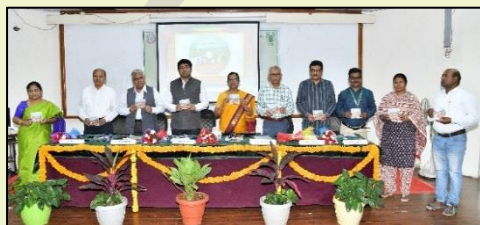
Annual Action Plan Workshop of KVKs