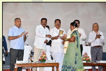
Hon'ble Minister facilitating the farmer