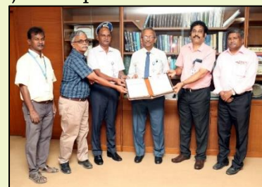
VC, TANUVAS during MoU signing ceremony