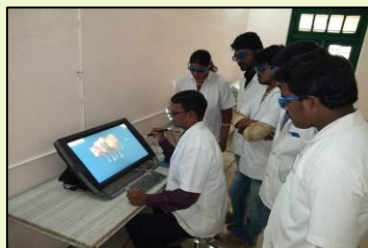
Demonstration of Virtual Dissection Software of Cow

Project. It is one of the latest innovations for teaching of Veterinary Anatomy Developed jointly by the Department of Veterinary Anatomy, College of Veterinary Science, Tirupati and IDA solutions Pvt. Ltd, Mumbai. This