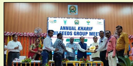
Oilseed Research Station, Latur of VNMKV awarded as Best Research Centre