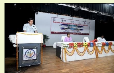
Multi-Stakeholders workshop on 'Millets for Next Generation'

Farmers, Extension functionaries, FPOs, students and scientists. A series of lectures on importance of millets, their nutritional and health benefits, role as climate resilient crop, high yielding varieties in different small millets, their scientific cultivation, protection measures, value addition and processing were delivered. Practical session was organized to demonstrate the processing and value addition in millets.