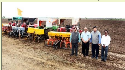
VNMKV makes 1550 acres of fallow land cultivable

administration under the guidance of Vice Chancellor Dr Indra Mani employed manpower and tractors, JCP, other machinery to remove unwanted trees and shrubs and make land ready for sowing during this kharif season. The university has also constructed four new big farm ponds and renovated old big farm pond to ensure adequate water supply for the land and water conservation. These farm ponds have total 9 crore litre water storage capacity to address protective irrigation during dry spell.