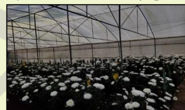
Chrysanthemum cultivar Early White in flowering stage