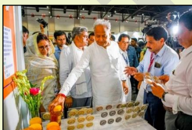
Hon'ble Chief Minister of Rajasthan, Shri Ashok Gahlot discussing about Maru Shakti Madhu in Divisional Kisan Mela held at Jaipur during 16 to 18 June 2023.