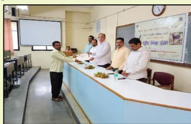
Distribution of certificates to trainee

Three-day training on Commercial Goat Farming, was organized during 18-20 April 2023 by Department of Livestock Production Management,