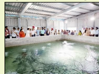
RAS Demonstration Unit

An orientation workshop on intensive aquaculture technologies i.e., recirculatory aquaculture system (RAS) and Biofloc based Aquaculture (BFA), was organized by College of Fisheries (CoF), for capacity building of officials of Department of Fisheries (DoF), Punjab and aspiring farmers/youth of the State. Nineteen Fisheries Officers/Senior Fisheries Officers and 29 farmers/entrepreneurs attended the workshop. A Capacity Building Resource Centre for Intensive Aquaculture Technologies, has been established at Varsity under Pradhan Mantri Matsya Sampada Yojana (PMMSY) of