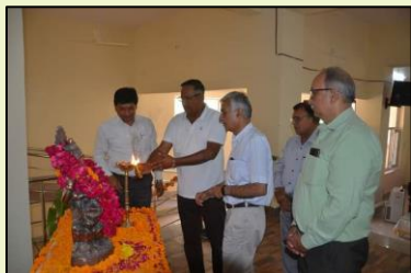
Lightening of Lamp before Goddess Saraswathi by the Dignitaries