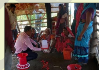
Distribution of poultry farming equipments to tribal women