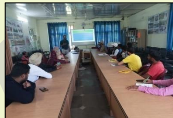
15 days certificate course on fertilizers for input dealers at KVK Poonch