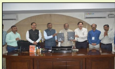
Signing of MOU between MAFSU, Nagpur and Karkheda Agri Producer Company Ltd, Akola