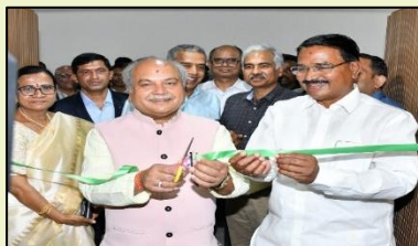
Inauguration of EEI, Auditorium by Shri Narendra Singh Tomar, Union Minister of Ag.&FW