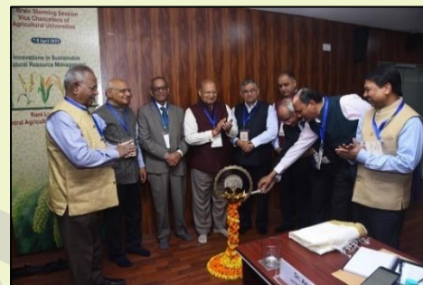
Dignitaries lighting the lamp

In view of the natural resource degradation issues and further emerging challenges as well as the opportunities, the 11 th Brainstorming Session of Indian Association of Agricultural Universities (IAUA), New Delhi was organized at the Rani Lakshmi Bai Central Agricultural University (RLBCAU), Jhansi during 7-8 April 2023 on Innovation in Sustainable National Resource Management.