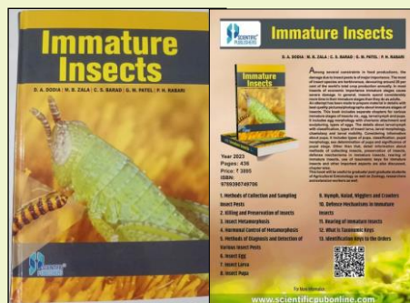
Cover page of the book