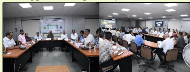
Glimpses of the meeting

Farming community, Scientific community and New Technical Programmes of AAU were approved, respectively.