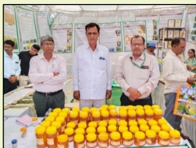
Exhibition of Maru Shakti Madhu in Kishan Mela, SKRAU, Bikaner

Students, under the guidance of experienced faculty members, actively participate in the honey processing operations. They gain hands-on experience in handling, filtering, and packaging the honey using modern equipment and techniques. This practical exposure allows them to develop essential skills in honey processing and enhances their understanding of the industry's intricacies.