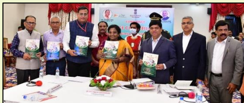
Release of G-20 Souvenir of PJTSAU by the Hon'ble Governor of Telangana

areas of village adoption, NCC, NSS activities in University colleges. In addition, progress of Chancellor Connects Alumni and implementation of National Education Policy 2020 was also presented. During the meeting, G20 Souvenir comprising the activities conducted at PJTSAU was released by the Hon'ble Governor.