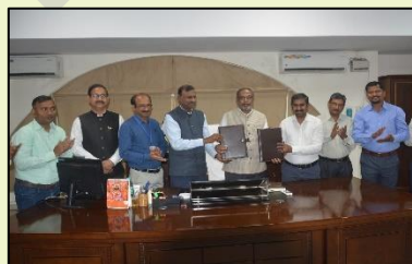
Signing of MOU between MAFSU, Nagpur and Reliance Foundation, Mumbai

The Directorate of Extension Education, MAFSU, Nagpur signed an MoU with the Reliance Foundation on 29 April 2023 at the University HQ. This MoU is signed with a vision to share the technical knowledge in the field of animal husbandry, dairying and fisheries for the benefit of farmers across the