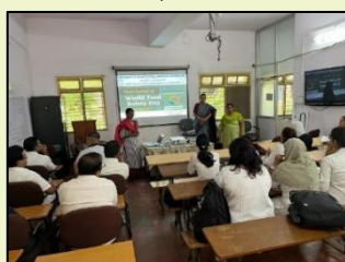
World Food Safety Day Programme