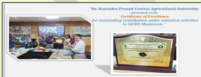
Certificate of Excellence for outstanding contribution under extension in AICRP-Mushroom