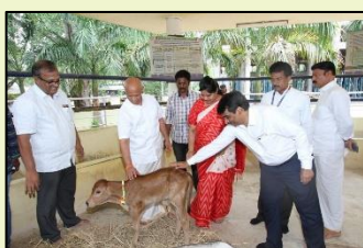
Sahiwal calf born on 24-6-2023 through IVF Technology

with TTD for research on Augmentation of Productivity Through Assisted Reproductive Technologies in Cattle. The main objective of this project is to conserve the native breeds of cattle i.e Ongole, Sahiwal and Gir. In this regard, the university has entered MoU with Tirumala Tirupati Devasthanams. As a result, the first IVF Sahiwal calf was born on 24-6-2023, and it is our pride to inform that it is a first calf in India to have born through this technique and it was named as Padmavathi, and 2 nd calf was born on 27 June 2023 and it was named as Vyshnavi.