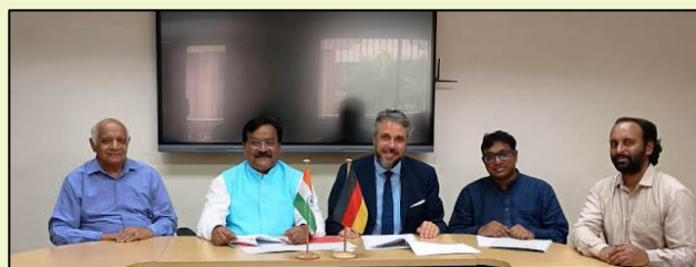
VNMKV signed a MoU with GIZ (Germany) for collaborative work on AgriPV