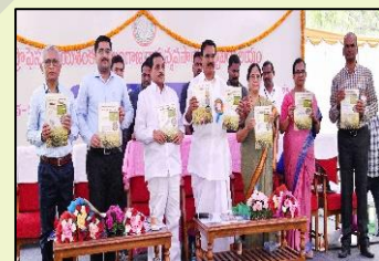
Dignitaries Releasing Publication